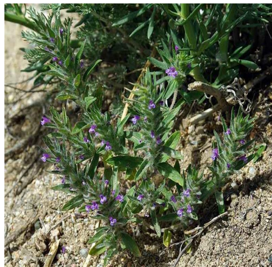
Figure 1. Ziziphoratenuior L.

(Mohammadi and Mohammadi Mehdiabadi Hassani, 2017) and antibacterial properties and is used in dairy foods as a flavoring and preservative constituent (Abdolshahi et al., 2018). As these effects have been reported in a large number of studies, the present study aimed to review the physiological and pharmacological effects of bioactive compounds obtained from Z. tenuior .