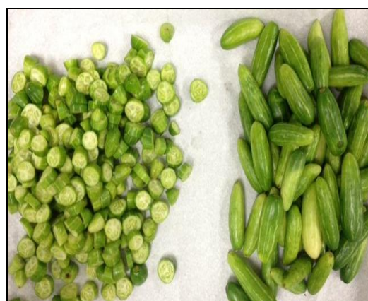
Figure 2. Picture of C. grandis fruits

been suggested as the major mechanism of their antibacterial activity. This complex induced by tannins, is considered being toxic and inhibitory to microbial enzymes. Studies have suggested that this inhibitory mechanism involves direct interaction with membranes, extracellular proteins and cell walls. In this study, tannins may have also played a major role in inhibiting the growth of microorganisms tested. Shaheen et al. (2009) also reported similar phytochemicals testing positive in their study.