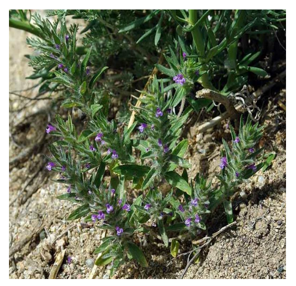
Figure 1. Ziziphoratenuior L.

(Mohammadi and Mohammadi 2017) Mehdiabadi Hassani. and antibacterial properties and is used in dairy foods as a flavoring and preservative constituent (Abdolshahi et al., 2018). As these effects have been reported in a large number of studies, the present study aimed review the physiological to and effects of bioactive pharmacological compounds obtained from Z. tenuior.