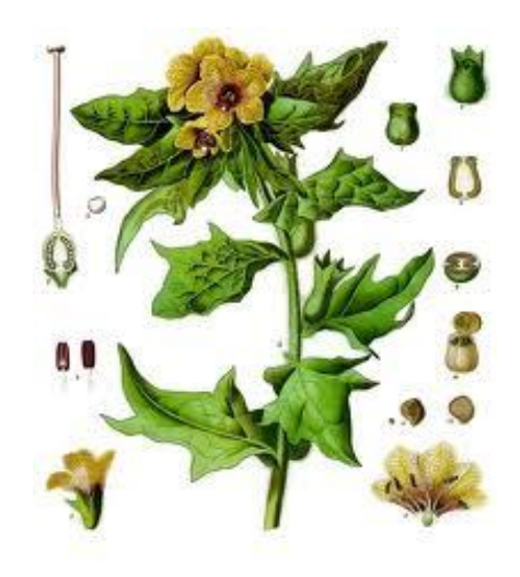
Figure 1. Black henbane

1913). BH is an annual or biennial and it grows up to three feet tall (Figure 1).