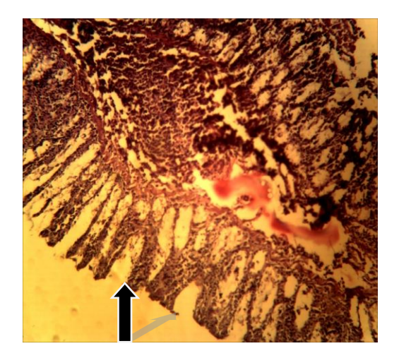
Figure 1: A representative stomach section showing unremakable mucosal changes with normal epithelia lining (H and E x 250).