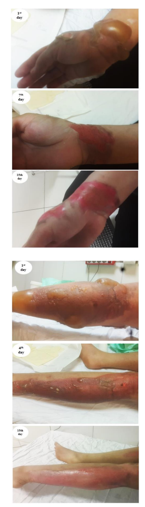
Figure 2. Comparison of treatment time in three time intervals between the studied groups. (A) Control; (B) intervention.