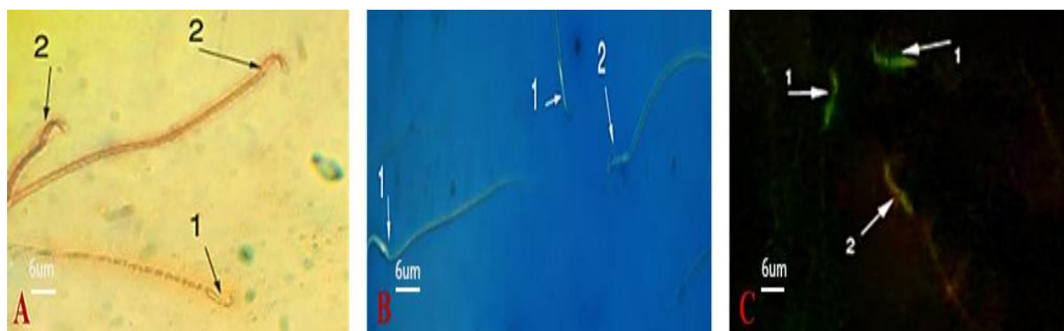
Figure 1. Sperm viability, and chromatin and DNA qualities analyses. A) Eosin-nigrosin staining: Viable sperm (1) with uncolored head and non-viable sperms (2) with pink-red head can be observed (X400); B) Aniline blue staining: Sperm heads with mature nuclear chromatin (1) appear light blue and sperm head containing immature nuclear chromatin (2) is dark blue (X400); C) Acridine orange staining: Sperm cells with normal DNA integrity (1) exhibit green fluorescence and sperm with single-stranded DNA (2) appears orange-red (X1000).

The aniline blue and acridine orange staining techniques were also employed to surveil sperm cells chromatin and DNA qualities, respectively (Figures 1B and 1C), (Azad et al. 2018).