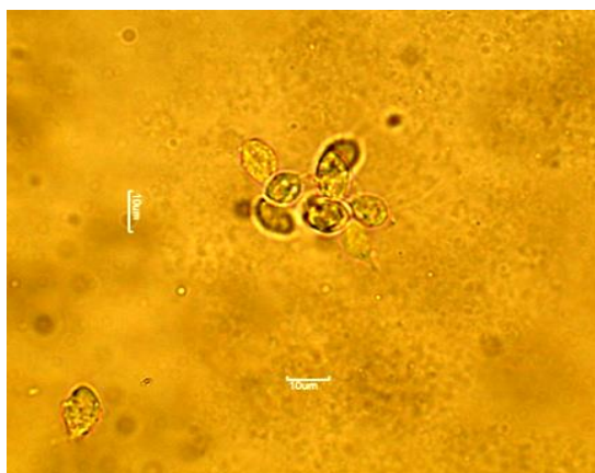
Figure 2. T. gallinae recovered from infected pigeons.