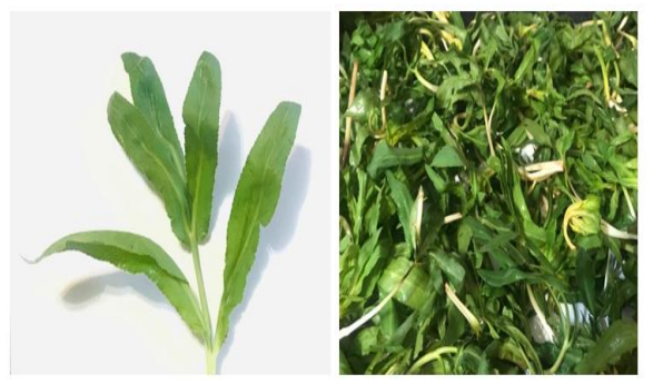
Figure 1. Falcaria vulgaris plant.

Considering the increasing value and special place of medicinal plants in pharmaceutical industries and the approach of communities towards the use of these plants and their derivatives (Kumar et al., 2013), the purpose of this review was to investigate therapeutic, pharmacological and phytochemicals properties of F . vulgaris plant in the treatment of different diseases in traditional medicine and experimental studies.